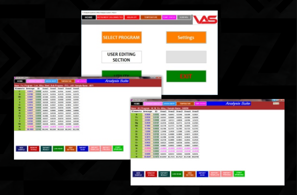
4th Generation Analysis Suite Software