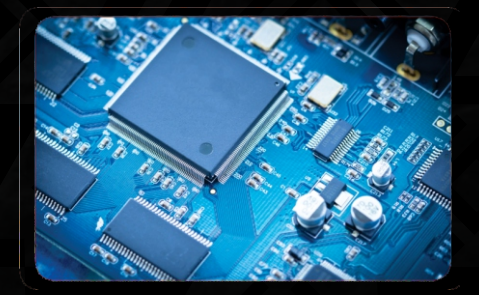
V-MAP current controlled source with true real time 100KHz linear regulated power source.